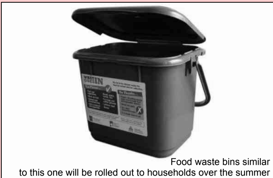
Food waste bins similar to this one will be rolled out to households over the summer

Last month, the Lib Dems were able to announce major improvements to the waste collection in our area. Glass, plastic, can, paper and cardboard collections will all become weekly - and brown bin collections will double in frequency, being collected every 2 weeks!